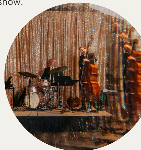
PHOTO BOOTH SPONSOR